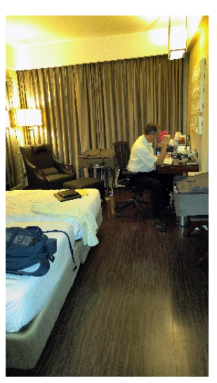
Studying in our hotel

Remember to watch "Confirming the Churches Bible Class" which streams live on Tuesday evenings at 6:00 central time. It can be viewed on YouTube, Google+, or our own web site at acts1541.org. If you want a weekly reminder and a direct link to the YouTube channel, tell me email address on which you would like to receive the link.