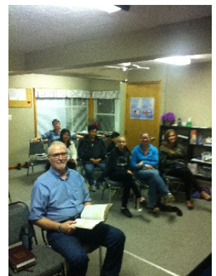
One-third of the Riverview, N.B. church

The Crown Point, Indiana church, with which we regularly worship, is just such a church as defined in our mission statement. The church was planted here about 15 years ago and has a strong, committed local nucleus, but needs encouragement for stability and focused service. They are in the process of construction for a new meeting place, and are saving money by not having a located preacher until they get moved into it (probably next fall). In the mean time several men take turns in the pulpit. I have preached five times in the past ten weeks, and in January began teaching the adult class on the book of