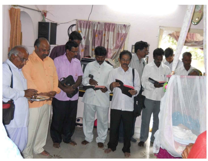
Preparing to serve the Lord's supper in a house church in India.

Introduction to Old Testament Books: The Content Purpose and Importance of Each Book in the Old Testament is the seventh book published by A. L. Parr. Here is clear discussion of how each Old Testament book fits into God's complete revelation. With a wide variety of features this 332-page text is a resource that you will use in every study of the Old Testament. An outline of each book shows the message and character of the book at a glance. Background and selected verses of each book are only some of the information you need in your study of God's word.