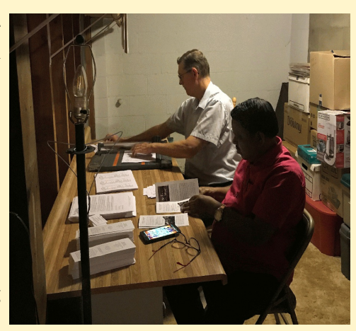
Preparing literature for distribution

All our books and tracts are given free to missionaries and mission churches thanks to contributions from caring Christians in various places. Proceeds of literature sales