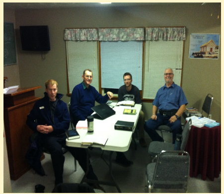
Leadership training in New Brunswick

of these churches, Al is prepared with the kind of lessons they need to encourage them to persevere in faith through the loneliness and difficulties that are part of living for the Lord in their communities. Many have found it nearly impossible to find a preacher willing to move to such an area, or to work with a church in such conditions.